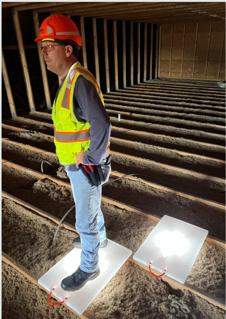
The intensity of the light can be adjusted. Brightness level does effect battery life as follows:

The diamond-plate surface provides a non-slip surface, while traction studs are installed at all 4 corners as an additional Anti-Slip measure.